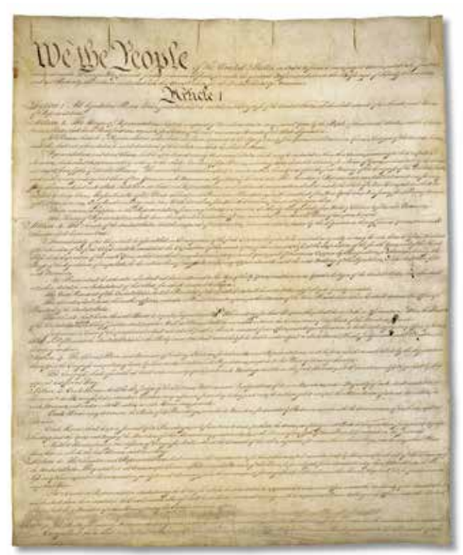
The Constitution of the United States.

The Constitution, written in 1787, created a new system of U.S. government—the same system we have today. James Madison was the main writer of the Constitution. He became the fourth president of the United States. The U.S. Constitution is short, but it defines the principles of government and the rights of citizens in the United States. The document has a preamble and seven articles. Since its adoption, the Constitution has been amended (changed) 27 times. Three-fourths of the states (9 of the original 13) were required to ratify (approve) the Constitution. Delaware was the first state to ratify the Constitution on December 7, 1787. In 1788, New Hampshire was the ninth state to ratify the Constitution. On March 4, 1789, the Constitution took effect and Congress met for the first time. George Washington was inaugurated as president the same year. By 1790, all 13 states had ratified the Constitution.