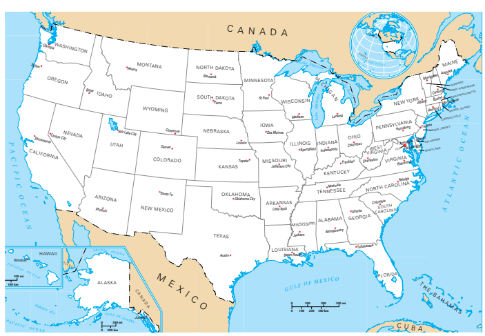
Map of the United States including state capitals.

The Constitution did not establish political parties. President George Washington specifically warned against them. But early in U.S. history, two political