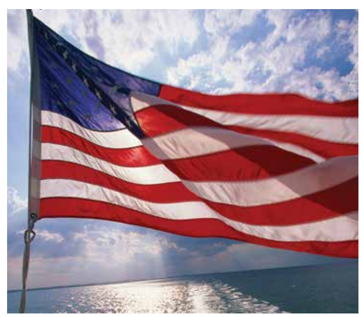
The American flag is an important symbol of the United States.

When the United States became an independent country, the Constitution gave Congress the power to establish a uniform rule of naturalization. Congress made rules about how immigrants could become citizens. Many of these requirements are still valid today, such as the requirements to live in the United States for a specific period of time, to be of good