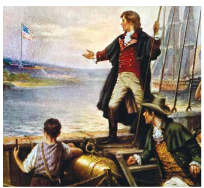
In "The Star-Spangled Banner," by Percy Moran, Francis Scott Key reaches toward the flag flying over Fort McHenry. Courtesy of the Library of Congress, LC-USZC4-6200.