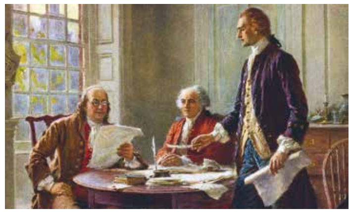
Benjamin Franklin, John Adams, and Thomas Jefferson in "Writing the Declaration of Independence, 1776," by Jean Leon Gerome Ferris.

The Declaration of Independence lists three rights that the Founding Fathers considered to be natural and "unalienable." They are the right to life, liberty, and the pursuit of happiness. These ideas about freedom and individual rights were the basis for declaring America's independence. Thomas Jefferson and the other Founding Fathers believed that people are born with natural rights that no government can take away. Government exists to protect these rights. Because the people voluntarily give up power to a government, they can take that power back. The British government was not protecting the rights of the colonists, so the colonies took back their power and separated from Great Britain.