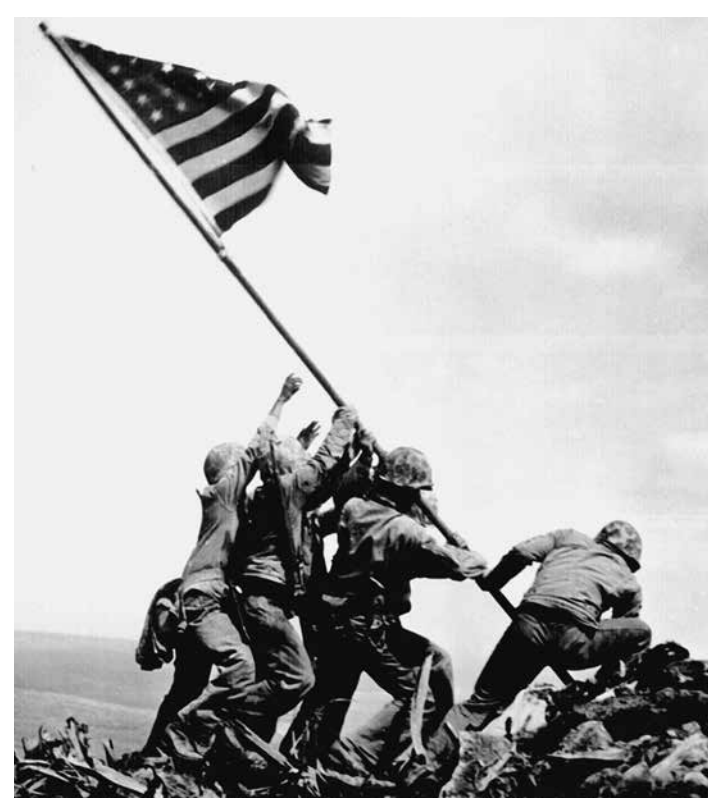
"Raising the Flag on Iwo Jima," photographed by Joe Rosenthal, Associated Press, 1945.

From 1959 to 1975, United States Armed Forces and the South Vietnamese Army fought against the North Vietnamese in the Vietnam War. The United States supported the democratic government in the south of the country to help it resist pressure from the communist north. The war ended in 1975 with the fall of Saigon, the capital of South Vietnam. In 1976,