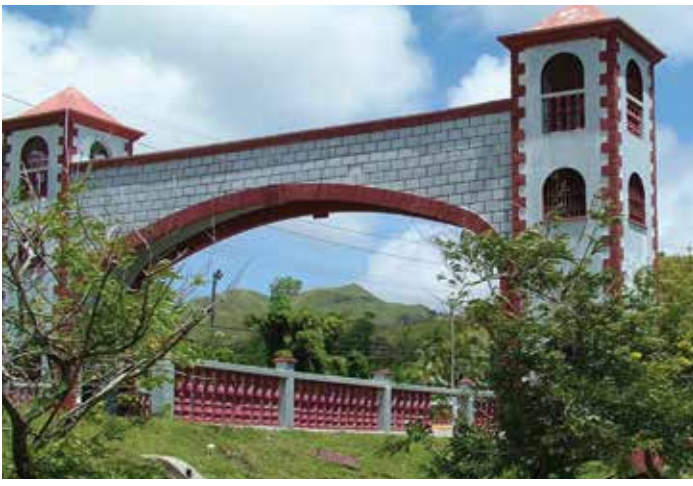
Old Spanish Bridge in Umatac, Guam.

The northern border of the United States stretches more than 5,000 miles from Maine in the East to Alaska in the West. There are 13 states on the border with Canada. The Treaty of Paris of 1783 established the official boundary between Canada and the United States after the Revolutionary War. Since that time, there have been land disputes, but they have been resolved through treaties. The International Boundary Commission, which is headed by two commissioners, one American and one Canadian, is responsible for maintaining the boundary.