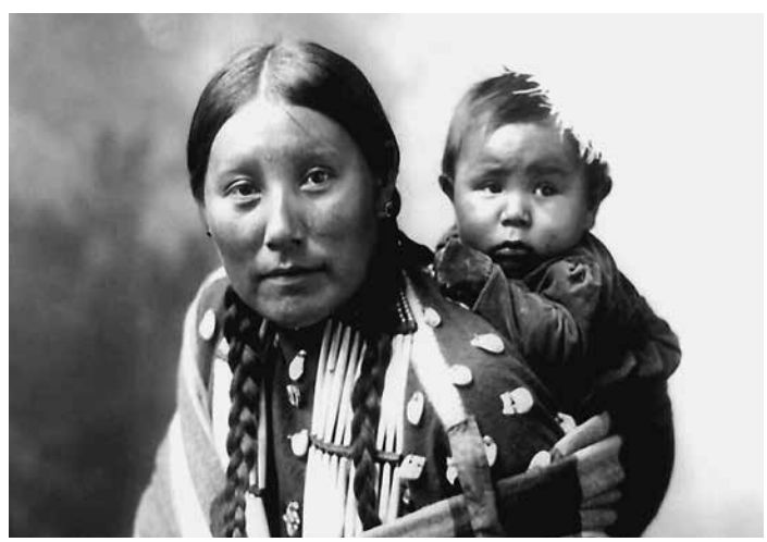
American Indian woman and her baby in 1899. Courtesy of the Library of Congress, LC-USZ62-94927.

On September 11, 2001, four airplanes flying out of U.S. airports were taken over by terrorists from the Al-Qaeda network of Islamic extremists. Two of the planes crashed into the World Trade Center's Twin Towers in New York City, destroying both buildings. One of the planes crashed into the Pentagon in Arlington, Virginia. The fourth plane, originally aimed at Washington, D.C., crashed in a field in Pennsylvania. Almost 3,000 people died in these attacks, most of them civilians. This was the worst attack on American soil in the history of the nation.