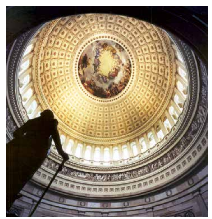
The Rotunda of the U.S. Capitol.

Congress is divided into two parts—the Senate and the House of Representatives. Because it has two "chambers," the U.S. Congress is known as a "bicameral" legislature. The system of checks and balances works in Congress. Specific powers are assigned to each of these chambers. For example, only the Senate has the power to reject a treaty signed by the president or a person the president chooses to serve on the Supreme Court. Only the House of Representatives has the power to introduce a bill that requires Americans to pay taxes.