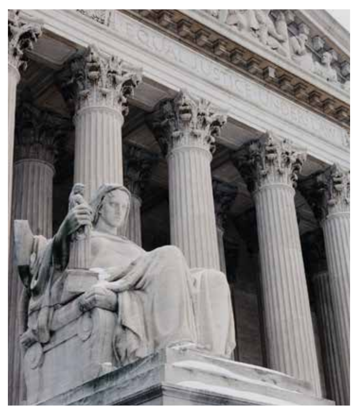
The Contemplation of Justice statue outside the U.S. Supreme Court building in Washington, D.C.

The judicial branch is one of the three branches of government. The Constitution established the judicial